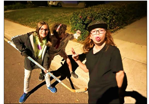
Getting in some outdoor sports while the fall weather holds out.

This year, we have been alternating between Wednesday and Friday nights for our meetings. Wednesday nights have been a night to hang out, have a meal, and have a small Bible study. With a few exceptions, we have been doing this every second Wednesday, while every other Friday night we have held an event. As you can see, we have been doing some things differently as compared to before the pandemic. It has been good trying something new—such as how we have fellowship, share a meal, or reflect on scripture.