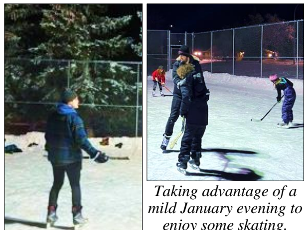
Taking advantage of a mild January evening to enjoy some skating.