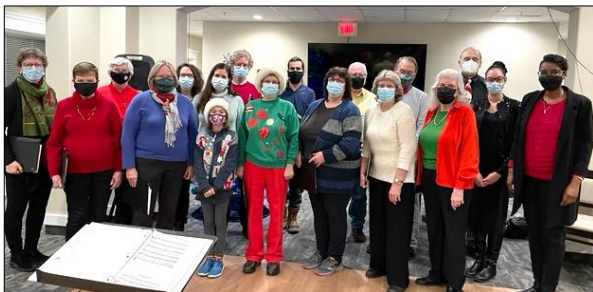
Choir at the Renaissance, December 2021