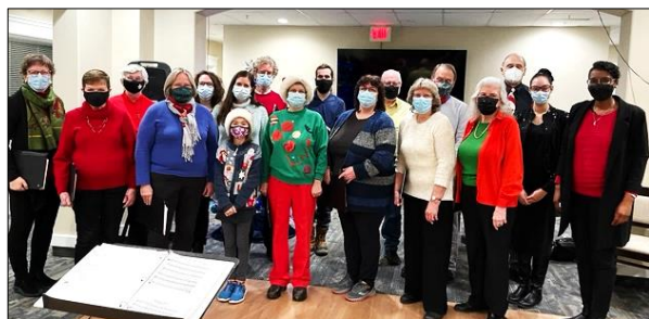
Choir at the Renaissance, December 2021