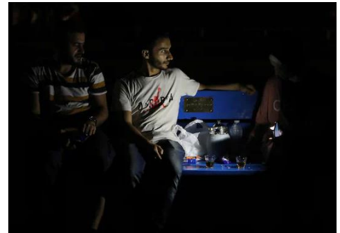
Using a cell phone for light during a power outage in Lebanon