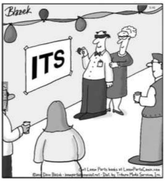
The games get pretty crazy at English teachers' parties.

PLEASE refer to our website at <u>firstbaptistregina.ca</u> for more specific information on these contribution methods. You may also contact the treasurer at (306) 775-1497 or email the church at <u>main_fbcregina@sasktel.net</u> for further details.