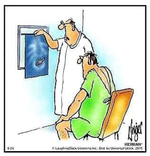
"I'll have to open you up again; that watch has great sentimental value."

On November 23rd at 7:30 pm, there will be a short meeting at the church and on Zoom to provide an update on homelessness in Regina and the involvement of the downtown churches. All are welcome. To join via Zoom, click here: <u>Join meeting</u>.