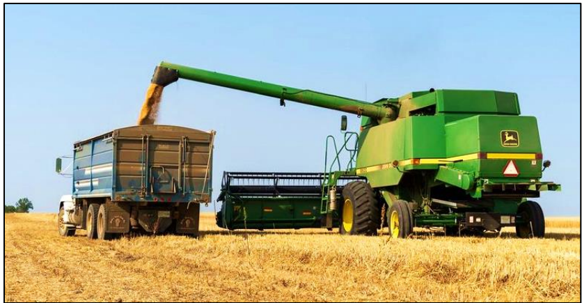
Harvest time in Saskatchewan

Sowing and harvesting are common metaphors in scripture. This isn't surprising, given how many people in New Testament times lived and worked in fields.