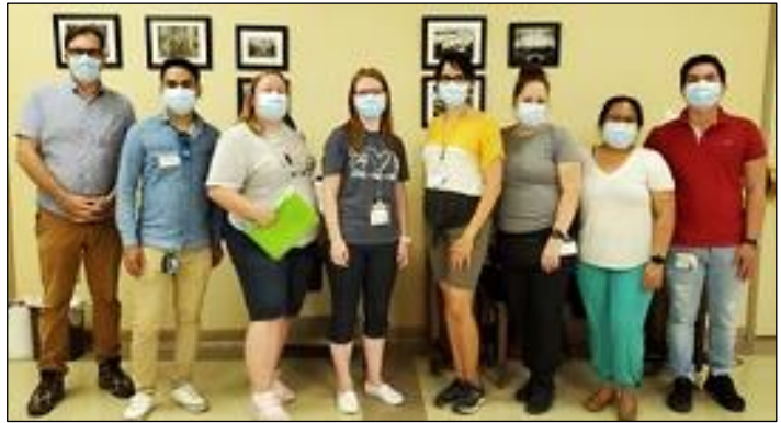
Regina Open Door & SK Health Authority staff at the July 27th vaccination clinic in our church basement

This past Tuesday, First Baptist was able to be of service to the Regina Open Door Society once again. We welcomed people from around the world, who came to receive their vaccine through the Saskatchewan Health Authority.