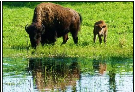
Bison cow and calf reflected in the water