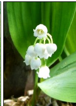
Lily of the Valley