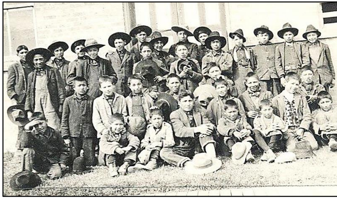
The Red Deer Indian Industrial School had one of the highest mortality rates in the country.

“The CBWC joins with the Tk'emlúps te Secwépemc to mourn the deaths of the 215 children discovered in an unmarked mass grave at the site of the Kamloops Indian Residential School.