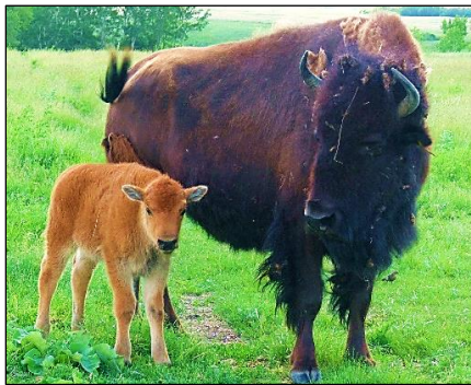
Newborn bison calf