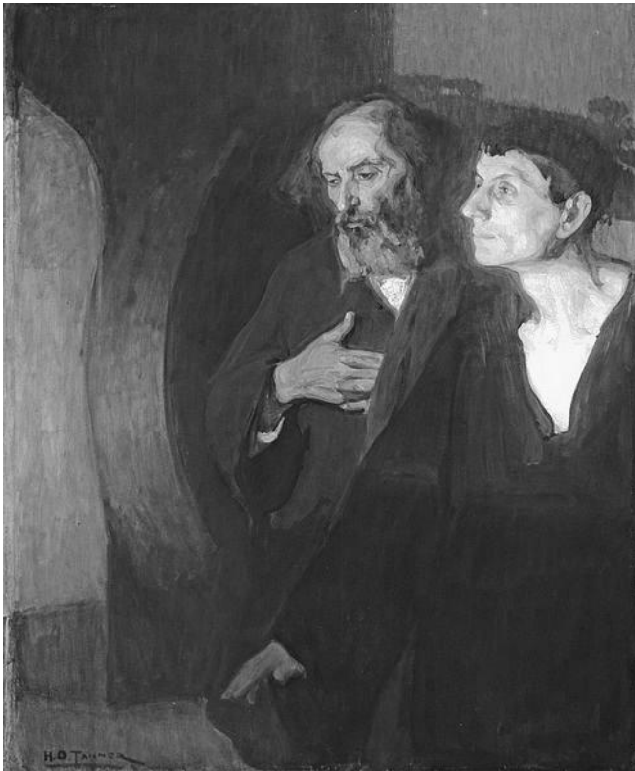
Two Disciples at the Tomb by Henry Ossawa Tanner, c.1906